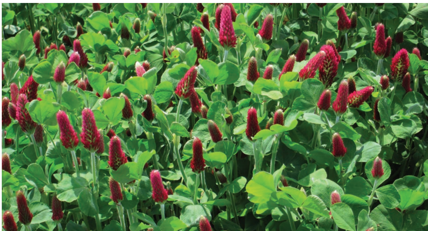
Crimson clover is the most popular legume cover crop in the United States.

a few fields having yield losses after cover crops and with some fields showing no difference. Many farmers reported a yield increase on their fields, but individual experiences varied. While the SARE/CTIC survey data set is by far the largest set available on cover crop yield impacts, it is worth noting that other cover crop studies have reported a range of yield impacts, from minor losses to minor increases in corn yields. For soybeans, some studies have shown that yields are unchanged with cover crops, while others have shown a modest improvement in yields. Fewer data reports are available on the yield impact of cover crops on other cash crops.