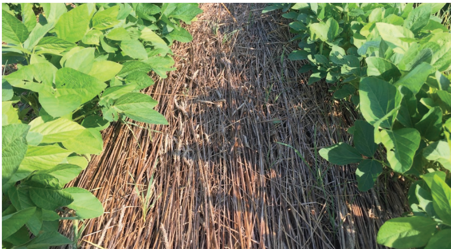
Cover crop mulches significantly reduce moisture loss from the soil, such as with the cereal rye residue shown here between soybean rows.

Looking just at those farmers who had one year of experience with cover crops leading up to the drought, their average yield increase in cover-cropped fields was 6% for corn and 11.4% for soybeans. With the high prices after harvest that year (na-