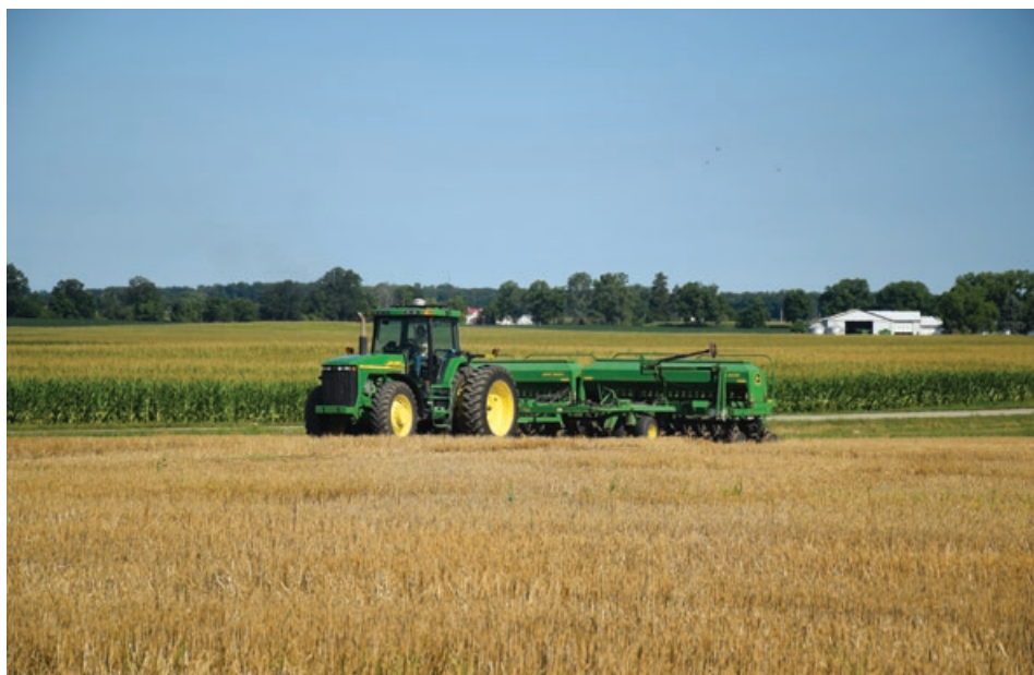
Four types of cover crops, including annual rye, oilseed radish, crimson clover and rapeseed, are being seeded into wheat stubble.

A positive first-year return from cover crop use will often occur during drought conditions, where cover crops are grazed (assuming that grazing infrastructure is already in place), or potentially in a situation with challenging herbicide-resistant weeds. When converting from conventional till to no-till, cover crops can help ease that transition, making it possible to break even in year one