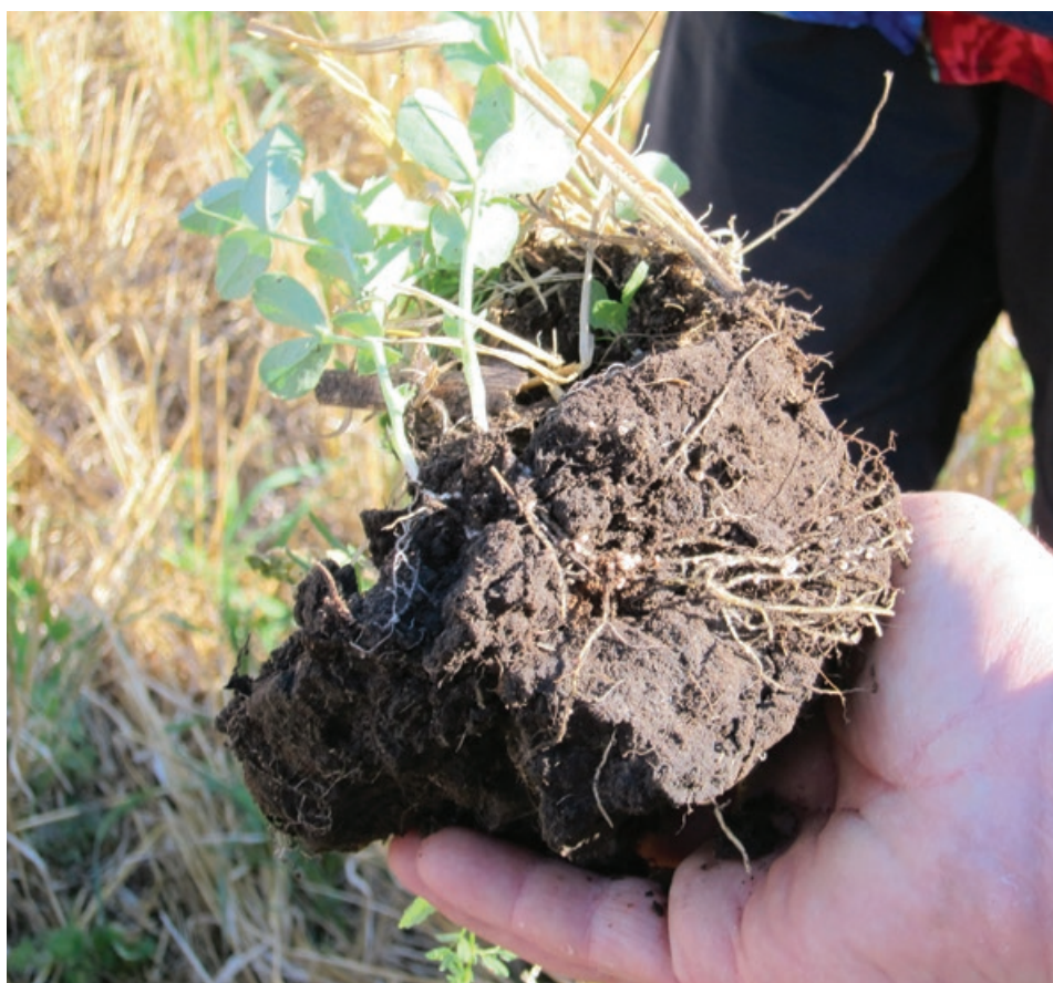
Clover cover crop roots form nodules with symbiotic bacteria that fix nitrogen, reducing the need for applying nitrogen fertilizers.

Soil biology also plays a greater role than previously understood in soil- and crop-nutrient dynamics. Cover crops, by increasing the portion of the year with living roots in the soil, stimulate soil biology and can enhance the growth of mycorrhizal fungi, particularly if soil disturbance is minimized. These changes in soil biology can begin in the first year of cover crop use, and they continue as soil health improves. Fungi and bacteria contribute nutrients to plant roots in exchange for carbohydrate exudates from the roots. Cash crops may also root more deeply following a deep-rooted cover crop, and earthworms create nutrient-rich tunnels that roots can access. These changes can occur in the soil fairly quickly, allowing a short-term fertility response. In the long term, organic matter