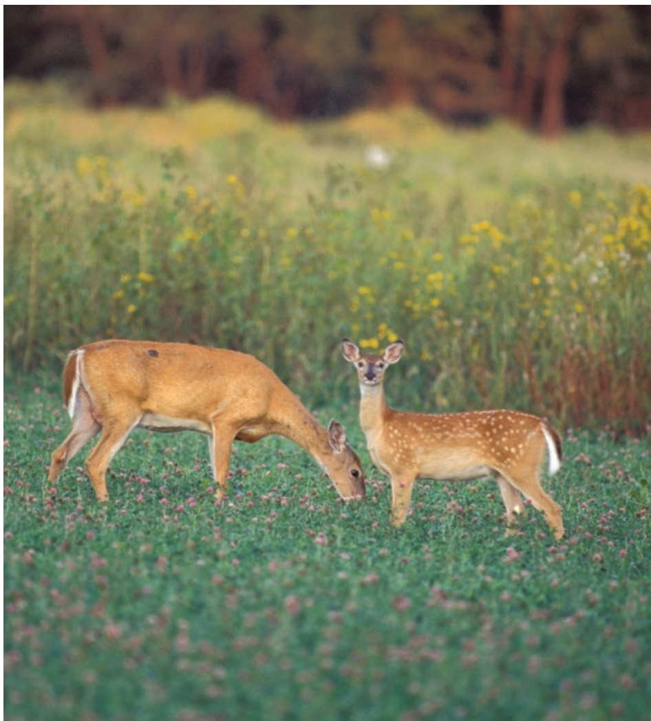
Cover crops can represent a recreation opportunity by helping to provide year-round food and habitat for wildlife such as deer.

the field and the less total risk of erosion. Eroded soil particles carry sediment with them into waterways.