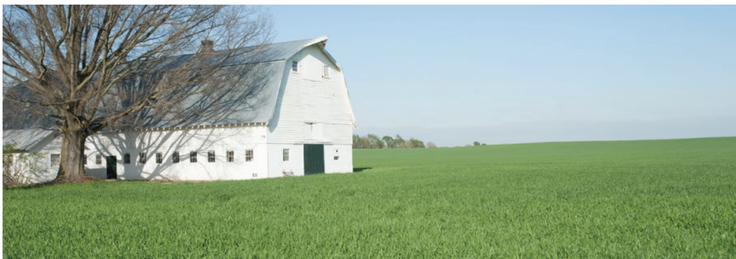
Cereal rye is the most widely planted cover crop in the United States, being used on several million acres for erosion control, weed suppression and soil improvement.

Peer-reviewed research findings and practical strategies for advancing sustainable agriculture systems