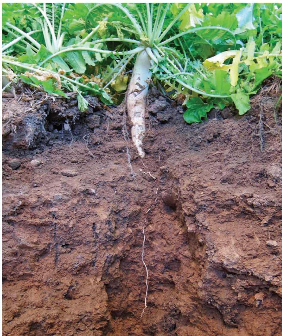
Cover crops that can root deeply, such as radishes, can help alleviate soil compaction.

While the triggering effect cover crops have on reducing tillage is notable, what is more important economically is that cover crops seem to ease the transition to no-till. Farmers have been advised for decades that they can expect an initial yield dip when changing to no-till but that if they stick