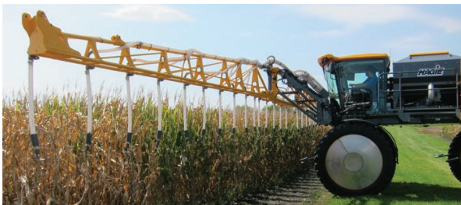
A cover crop interseeder can broadcast several hundred acres of cover crop seed in a day, allowing ag retailers and farmers to get cover crop seed established efficiently and early in the fall.

application, the cost of seeding is basically covered as part of the fertilization cost.