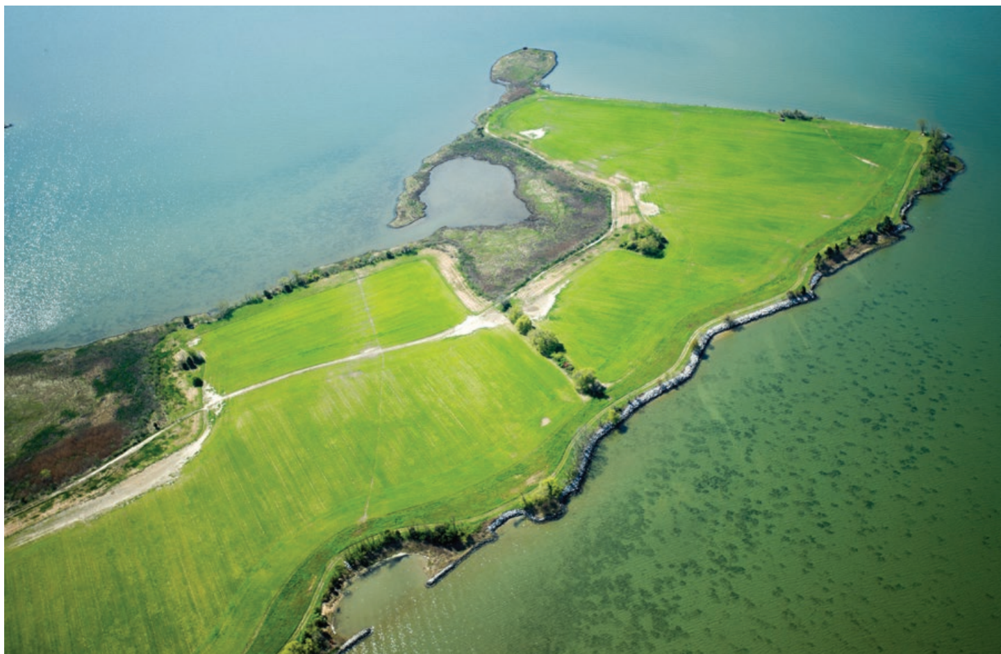
Researchers have found that cover crops are very effective at protecting water quality. Here, cover crops are growing in fields along the Chesapeake Bay.

The real-world effect of farm activities extends well beyond the farm gate. Collectively, the activities of farming operations affect not only regional ecosystems but also rural communities and society as a whole. As part of a holistic review of cover crop economics, it is worth noting some of the ways that cover crops can influence off-farm economics, especially in a consumer culture where buyers increasingly want to know the origin and environmental impact of the products they buy.