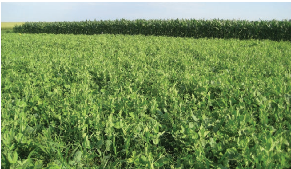
Incentive payments offered through NRCS are higher when planting a multi-species cover crop mix. The mix in this field includes oats, proso millet, canola, sunflowers, dry peas, soybeans and pasja turnips.

but as long as guidelines are met, generally a majority of applications are approved. As stated previously, these incentive payments should be viewed in the context of providing transition support rather than as a long-term economic subsidy.